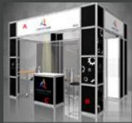
This picture is subject to modifications

300 companies 600 participants 5000 BtoB meetings 15 countries represented